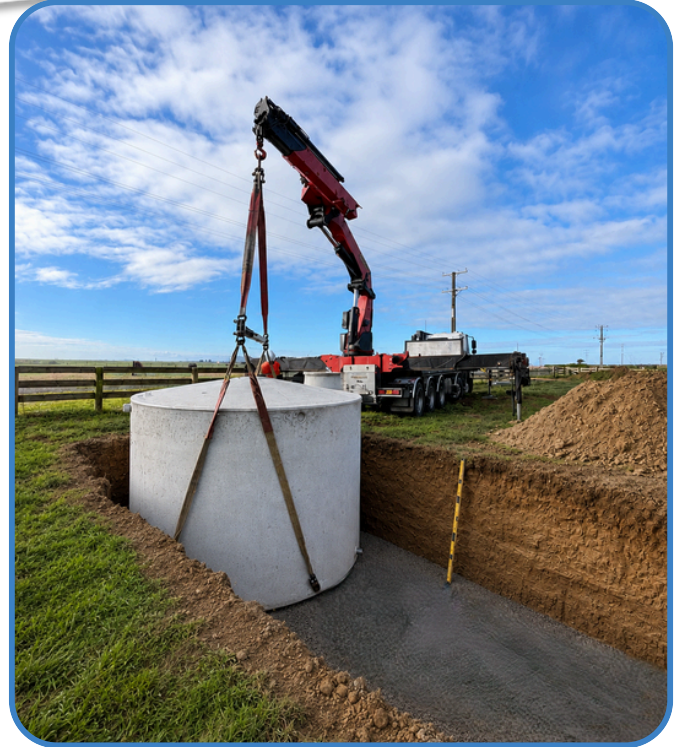
Example of correct truck positioning for partial buried tank.

Tanks should be backfilled as soon as possible to seal in to the ground. The backfill material should be clean, rock free soil or similar, suitable to avoid water flow entering around tank eg. no drainage metal, rubbish etc.