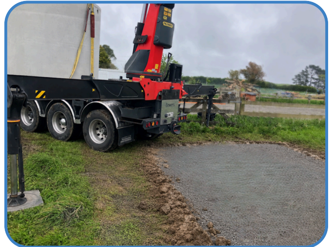
Example of the correct truck position for unloading onto the prepared site.

Note: The trucks must be able to back up to the immediate corner where each tank is being placed). This may mean a progressive excavation / installation will be required for partial or fully buried tanks. Truck has minimal reach & will need to reposition if there is more than one tank.