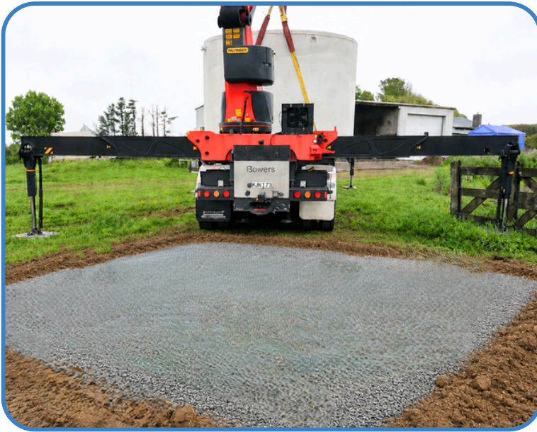
Example of the correct truck position for unloading onto the prepared site.

Note: Truck is required to be within 1.5m (from the centre of the crane to the corner of the hole) of excavation where each tank is going with truck being aligned on the diagonal of the hole.